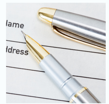
GUIDELINES FOR COLLECTING & USING PERSONAL DETAILS