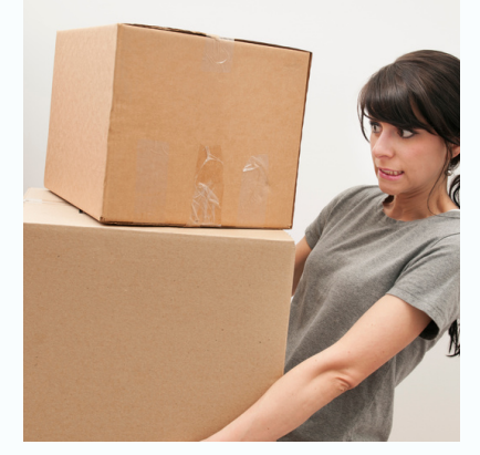
LIFTING, CARRYING OR PUSHING HEAVY LOADS