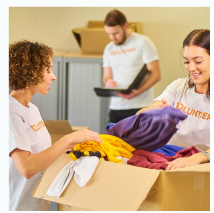
HOW THE HEALTH & SAFETY WORK ACT 2015 APPLIES TO VOLUNTEERS