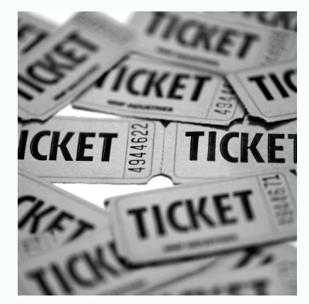
RULES FOR RAFFLES & GAMES OF CHANCE