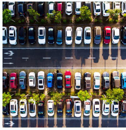
MANAGING TRAFFIC & MOVING VEHICLES