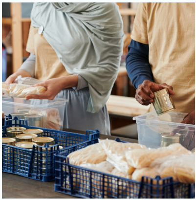
FUNDRAISING & COMMUNITY EVENTS FOOD SAFETY RULES