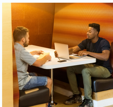
Tell and email work colleagues