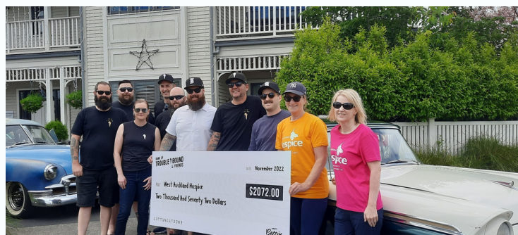
The Trouble Bound Hot Rod Club ran a car show with gold coin entry and raised more than $2,000.