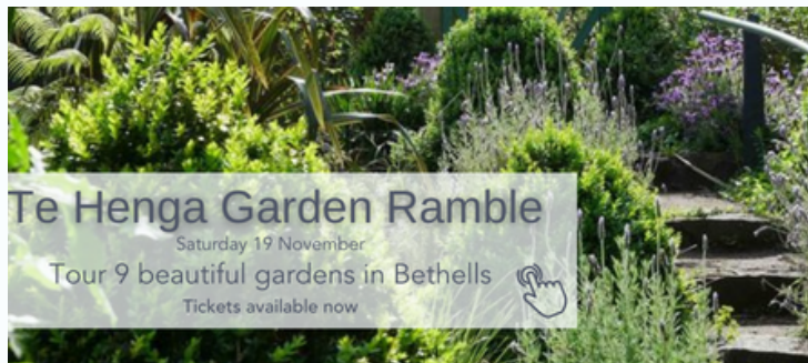
Susan organised a day ramble of 10 stunning gardens in honour of her daughter. The event raised over $17,000.