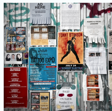
If you are running an event, put up flyers or posters, such as at your local community centre

Remember to keep your supporters informed as you go: share photos or videos, give progress totals, share updates on your event plans and how tickets are selling. And shout-outs and thank yous are a great way to show your appreciation and encourage others to support your efforts!