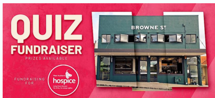
Business networking group BNI Nspire hosted a quiz night and raised $5,000.