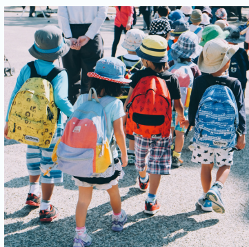
If your children are helping, tell their school and ask if they'll share it in a newsletter